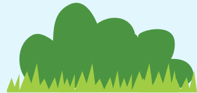
Vine or bush