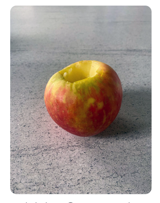
Adults: Core out the middle of the apple, but do not cut all the way through. Leave a layer of apple at the bottom so it is like a cup.

Be sure to ask an adult for help and permission before trying out this activity!