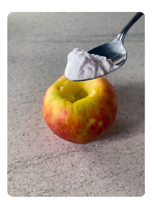
Kids: Scoop a spoonful of baking soda into the apple.

Adding a drop of dish soap will make a foamier volcano!