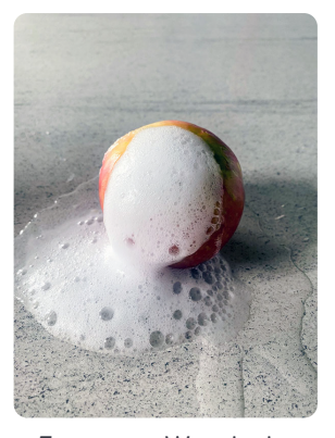
Everyone: Watch the volcano erupt!

Adding a few drops of food coloring before the vinegar will make colored eruptions!