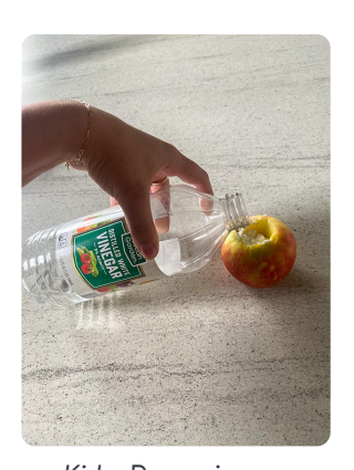
Kids: Pour vinegar into the apple from a cup or container that is easy to hold.

Adding a drop of dish soap will make a foamier volcano!